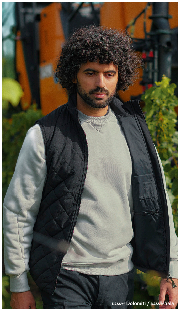
DASSY® Dolomiti / DASSY® Yala

Combine the DASSY® Jasper work trousers with our certified Fides knee pads. For the best knee protection.