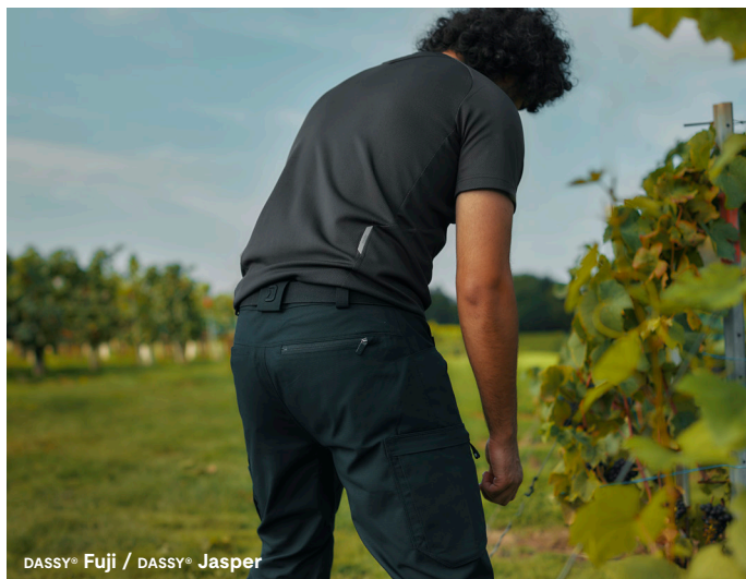
DASSY® Fuji / DASSY® Jasper