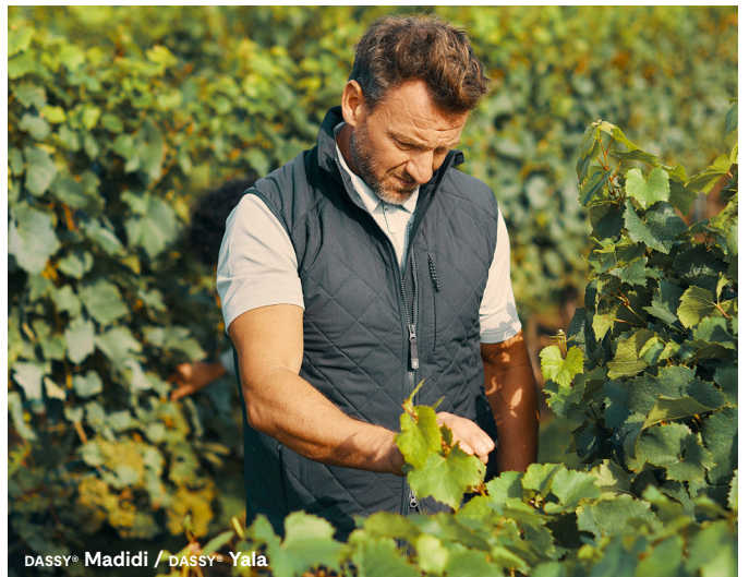
DASSY® Madidi / DASSY® Yala